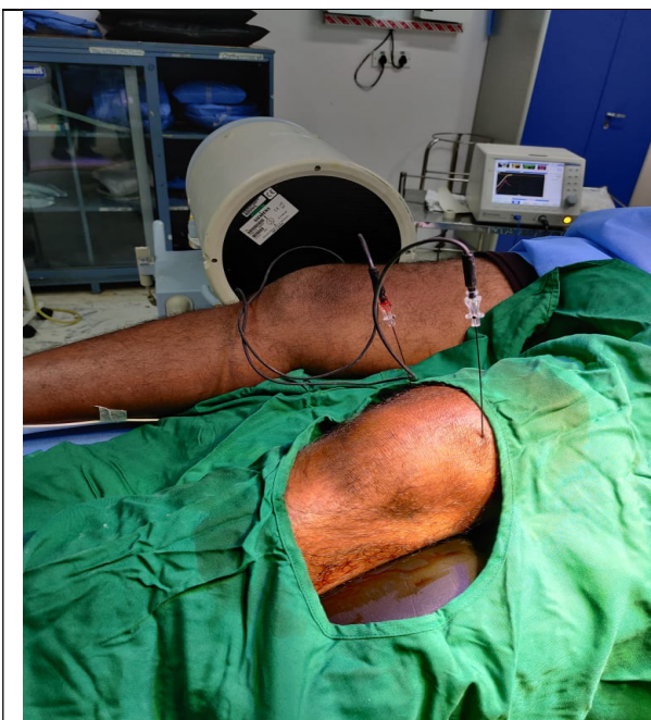
Radiofrequency ablation for Osteoarthritis knee with very good results