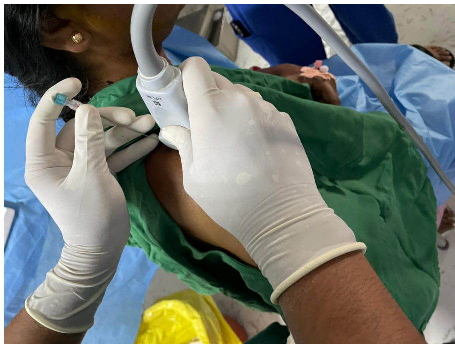
Ultrasound guided interventional procedures with fantastic results